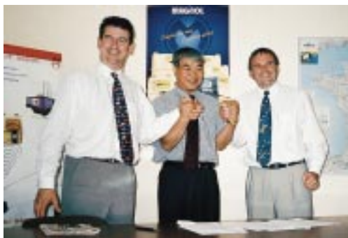
Let's work together to achieve our goals

LNG imports in Korea are anticipated to more than double by 2006 as a result of increased use in residential and industrial applications. While Korea Gas Corporation has responsibility for arranging natural gas supplies, the development of the city gas industry has been entrusted to the private sector. There are now 30 city gas companies. With the Korean economy recovering from the recent economic crisis in Asia, we are well positioned to capitalize on these opportunities.