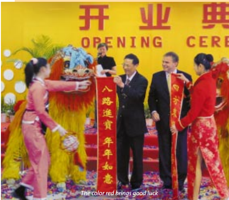
The color red brings good luck

The Joint Venture was officially registered in November 2000 and started operation in April 2001. The Joint Venture is fully equipped to assemble, test, and calibrate turbine and rotary meters along with volume correctors according to the international and Chinese standards. Operation officially started after the opening ceremony.