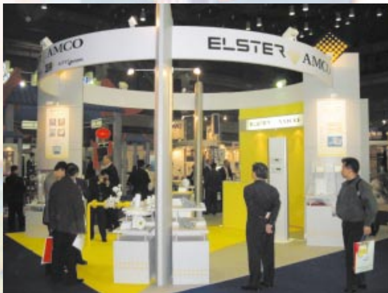
ELSTER-AMCO booth exhibiting the complete product range of the group

Our booth displayed products from different manufacturers within the group. There were residential and commercial diaphragm meters, industrial turbine meters and rotary meters equipped with EK230 and EK260 correctors (highly regarded by our Chinese customers), ELSTER-JEAVONS and AMCO regulators, regulation and metering systems and IGA Orpheus 4. The Gas-net F1 flow computer and Gas-lab gas analyzer were the highlight of the exhibition.