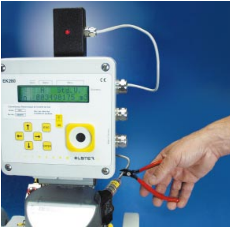
Fig. 2: A line break or line cut generates a malfunction warning

and this is a good thing because it is an absolute prerequisite. This is an indication of the reliability of the reed switches themselves, which can be used a million times over to great effect. Nevertheless, there are occasions, albeit rather seldom, when a reed switch bounces (then they generate too many pulses) or they stick together (then some pulses are missing). Determining a fault in the case of a reed switch is difficult if you do not fully know or are not able to use the possibilities available with an ELSTER system. The ELSTER gas metering devices always have two reed switches and one tamper protection switch (PCM) in the totalizer heads S1, S1D and S1V. The EK series of volume correctors can be programmed in such a way that they permanently compare the number of incoming pulses from the two reed switches (Fig. 1) and if there is a deviation of, say, only 3 pulses, they send out a warning. What's more, the volume correctors with a built-in data logger (EK230 and EK260) can also be programmed to enter any temporary differences in the incoming pulses in an archive together with the corresponding date and time as well as the time the error was detected and when the warning was lifted. With the aid of the ELSTER evaluation software it is then easy to monitor the error-free operation of the device.