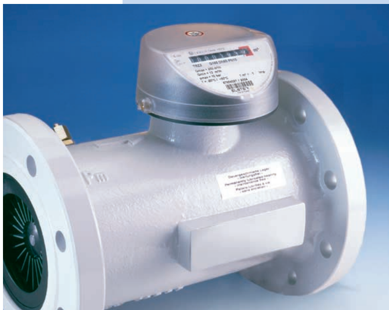
Fig. 1: New advanced ELSTER Turbine Meter TRZ2

This is exactly what we have achieved with the newly developed inlet flow guide in the TRZ2. The unique design with the orifice ring (Fig. 2) and the exactly balanced parameters such as channel