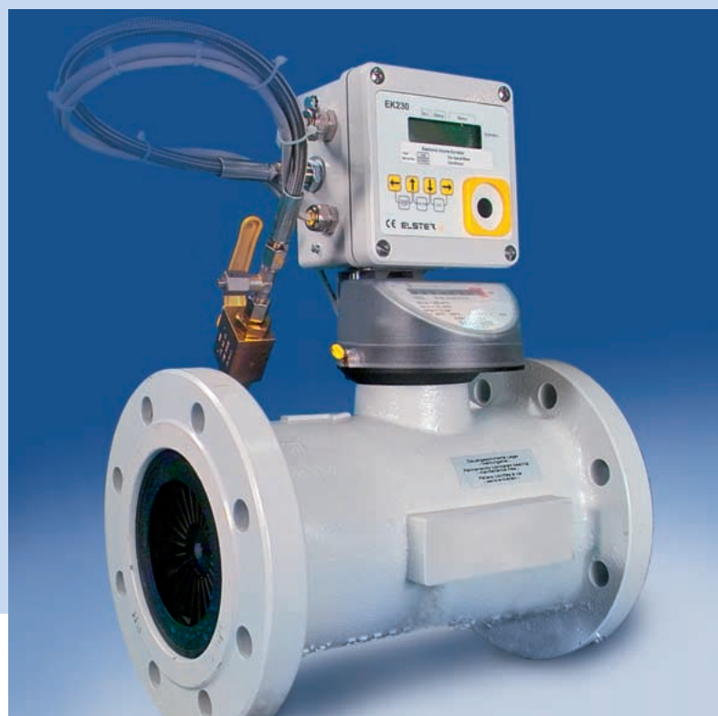
Fig. 5: TRZ2 with integrated thermowell and LF-pulsar combined with an EK230 volume corrector as pre-calibrated gas measuring system

frequency pulser option. When choosing the entire gas measuring system consisting of a volume corrector and turbine meter, which is completely calibrated exworks (Fig. 5), it is necessary to have a thermowell integrated in the gas meter. This is also a possible option with the TRZ2 line. The built-in thermowell not only have practical advantages, it is also a quality feature of accurate gas measurement. The integrated thermowell measures the temperature of the gas in the flow channel of the turbine meter, which is in the same state as it is for the pressure and the volume measurement. Because the state of the gas inside and outside the turbine meter is different, the accuracy of the gas measurement suffers when a thermowell is not integrated.