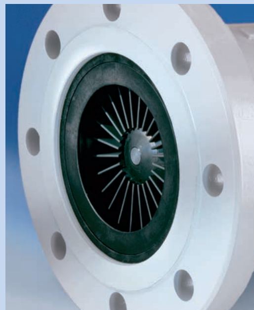
Fig. 2: ELSTER unique orifice ring is a major element of the inlet flow guide

Typically, the designer of gas measuring stations tries to keep the space required as small as possible, particularly in the case of a system which has to fit into a cabinet. This might not be such an easy job if the system consists of a regulator followed downstream by a turbine gas meter. The problem is the asymmetric flow profile behind a regulator, which gets even worse if the regulator is followed by an elbow or especially by a double elbow before the gas enters the turbine gas meter. A straight pipe in the meter inlet, i.e. bet-