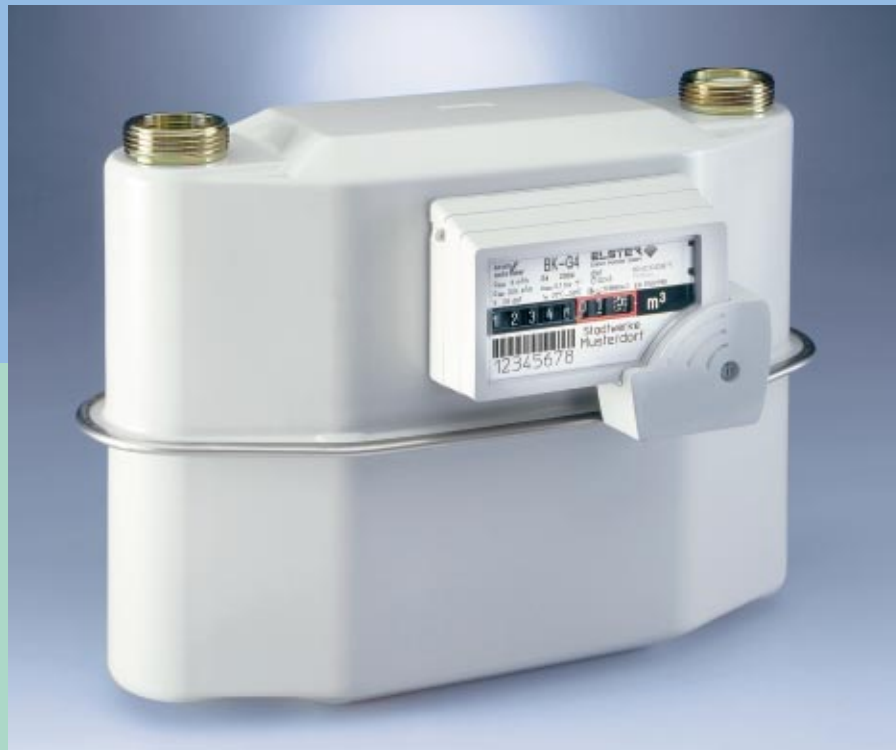
BK-G4 with Absolute-ENCODER

There is a deep-rooted preconception that automatic meter reading (AMR) can only be achieved at a reasonable cost if you use radio transmission as the basis for the process. However, especially when it comes to the new housing sector, a wire-based solution offers a number of advantages because wiring is relatively cheap during the construction phase. In addition, ELSTER's new M-BUS ENCODER solution provides a system which transfers original meter readings and, therefore, offers advantages when it comes to commissioning and process security for data transmission and billing.