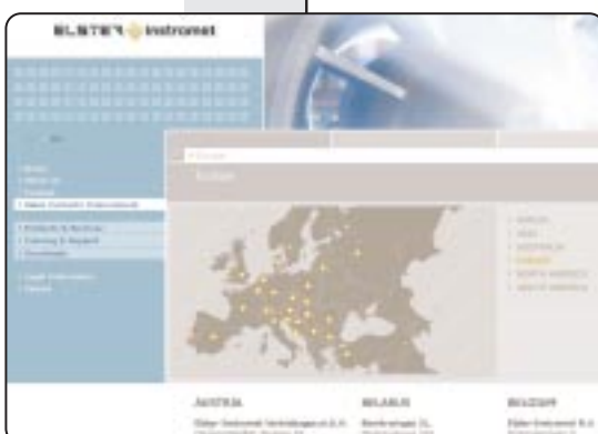
Fig. 2: Example of your contact partners – well structured and easy to find