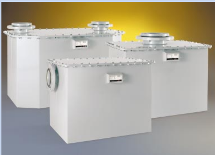
Different versions of the BK G-100

Just to remind you: the BK-G100 operates with eight 6-litre measuring units coupled together. The contents of the eight units are fed through two outlet channels into one collective channel, which then forms the connection to the pipes on the housing. The new BK-G100 has been designed to optimise the weight proportions and, by using the 6-litre measuring unit common to the rest of the commercial and industrial BK series, it can take full advantage of the benefits the series offers.