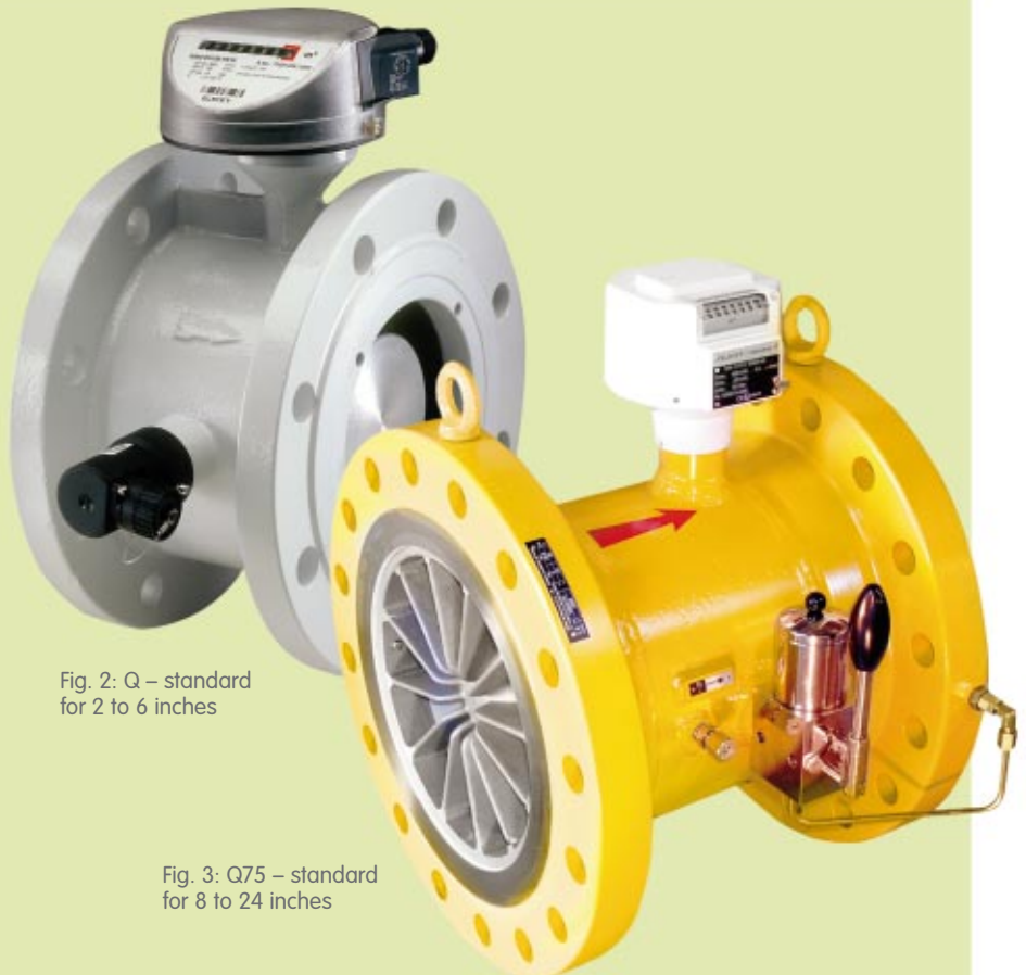
Fig. 2: Q – standard for 2 to 6 inches

The new quantometer product range shows that less can also be more!