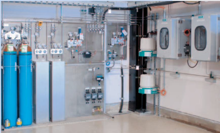
EnCal 3000 system

After installing the volume measuring system, the gas quality analysis system, consisting of a sampling unit, sample line, sample treatment unit (high-pressure reducer) and EnCal 3000, was installed. At the request of RAG/GIP, Elster-Instromet also installed the customer-supplied dew point measuring system and a sulphur gas chromatograph. The set up included the complete sample treatment system, as well as the installation and wiring of the indicators and display units in the electrical enclosures that we had delivered.