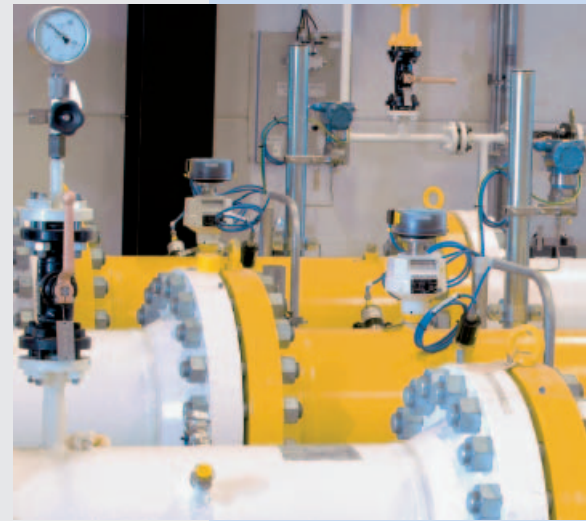
SM-RI-X with fitted ENCODER index

The energy flow computers (series gas-net FI), produced by Elster-Instromet in Dortmund, were calibrated at our testing facility with pressure and temperature transducers, and were then delivered to