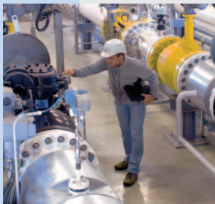
Haiming metering station: Elster sets the standards

system, which for the first time should be installed for custody transfer measurements in Germany.