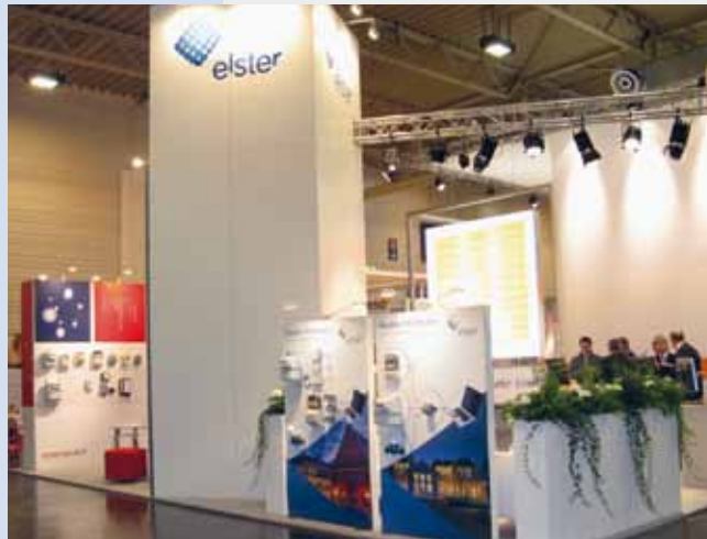
The modern stand concept was well received

A variety of topics and open questions could be explored in many interesting discussions with customers. One thing