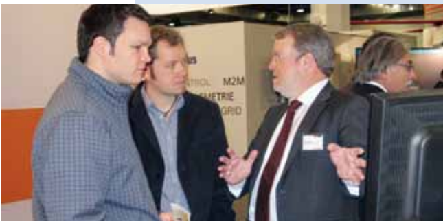
It's all about the right communication!