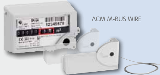
ACM M-BUS WIRE

The first choice communication solution is cable-based integration in an M-BUS system. A cable still provides the most reliable basis for data transfer and batteryfree operation ensures minimum operating costs.