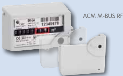
ACM M-BUS RF

If a wireless solution is preferred for data transfer, Elster offers the communication module ACM M-BUS RF. Wireless transmission takes place, for example, via wireless M-BUS according to the Open Metering System specification.