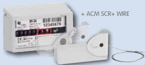
+ ACM SCR+ WIRE

For connecting units with SCR interfaces such as data loggers or external radio modules, the communication module ACM SCR+ WIRE will be able to be used in the future.