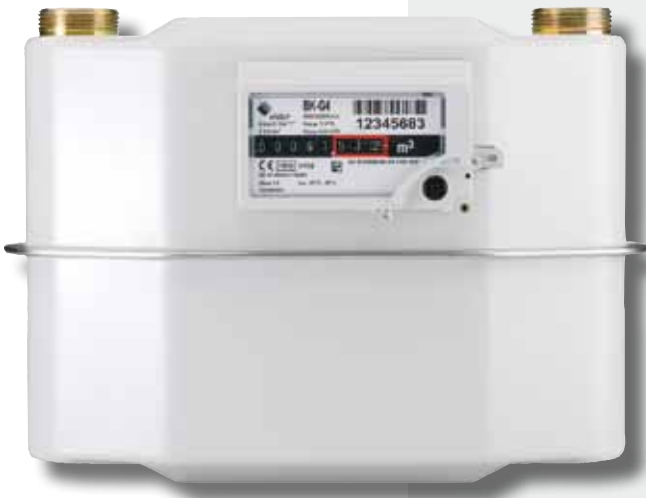
Diaphragm meter BK-G4 with Absolute ENCODER

Communication can take place, for example, according to the Open Metering System specification (see p. 13). For this solution, the communication module ACM M-BUS WIRE is provided.