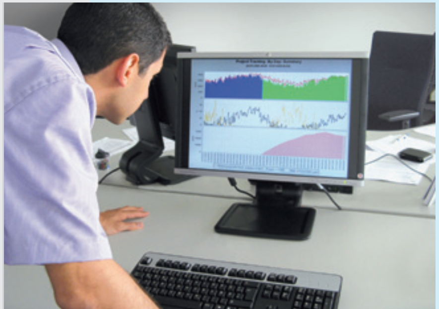
Meter data management supports a number of business processes, including sales, grid operation and procurement

Yet many energy supply companies are still waiting for an agreement on the standardization of all levels of communication, which does not appear to be imminent. Elster is therefore prepared to relieve its customers of a large part of the pros and cons argument, and offers complete solutions as a package from a single source (see also the following article).