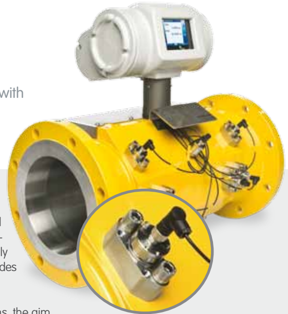
Transducer with mounting plate

Despite these additional paths, the aim was to achieve an optimum housing length. For this reason, the designers redeveloped the ultrasonic transducers and their mounting plate. All nominal meter sizes up to ANSI 600 can now be supplied with a design length of 3 \times D . The new transducers with the type designation NG are much smaller and also feature an intrinsically safe design. As before, the new mounting plate allows the transducers to be replaced without depressurizing the whole system. We can also supply a newly developed assembly tool for this purpose.