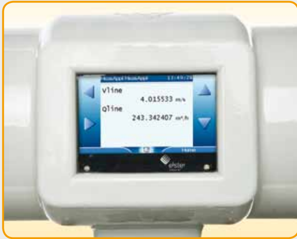
Electronics housing with display

software which runs on it allows the strict separation of the fiscal from the operational function and therefore permits the range of functions to be extended without additional approvals being required as long as the fiscal modules are not affected. This means that new customer requirements relating to diagnostics, archiving or data communications, for example, can be satisfied with considerable ease.